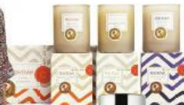
RIKRAK, available at Firdale Hotels