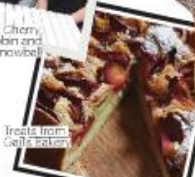
Treats from Gail's Bakery